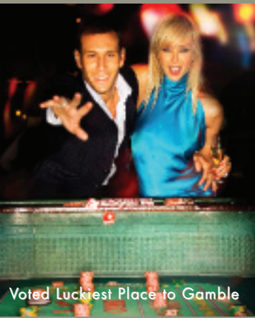
Voted Luckiest Place to Gamble