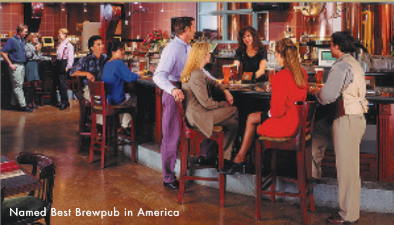
Named Best Brewpub in America

Reservations and Information: 877.670-3673, 775.786-5700 Website: eldoradoreno.com